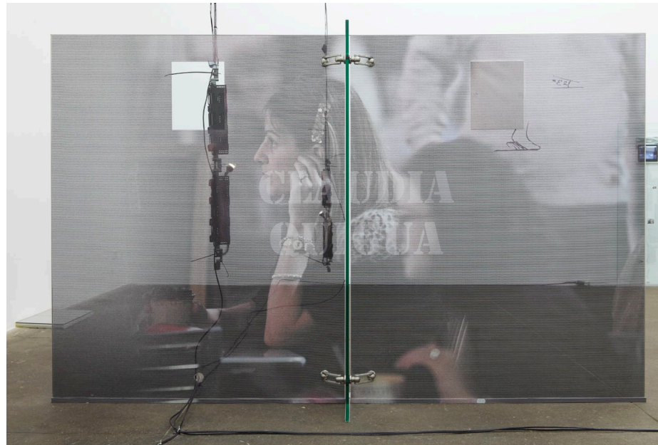
▲ Ben Schumacher, A Seasonal Hunt for Morels , 2013, tempered glass, hardware, inkjet on perforated vinyl, interview with auxiliary language specialists, drain hair, positioning targets, 153.7 x 241.3 x 38.1 cm.

a humanizing intervention and a nod to the Lumiere Brothers' 1895 film of workers exiting a factory, Andrew Norman Wilson's video Workers Leaving the Googleplex draws attention to the labor that powers these networks, and opens questions as to the forms of labor and power that remain invisible even after this task has been completed. Most notably, the corporate hierarchy of new media conglomerates suggests a tension between the values of the network and the realities of the capitalist system that inscribes them as marketing slogans rather than codes of ethics.